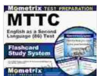
Image Alt Attribute: MTTC English as Second Language 86 Test Flashcard Study System Guide

MTTC English as a Second Language (86) Test Flashcard Study System: MTTC Exam Practice Questions & Review for the Michigan Test for Teacher Certification by Achille Rubini